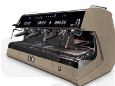
Dove / Tortora