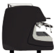
Black / Nero