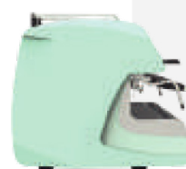
Water Green / Verde Acqua