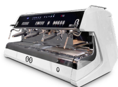
White / Bianco