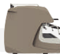
Dove / Tortora