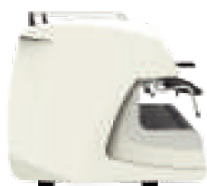
White / Bianco