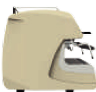
Beige / Beige