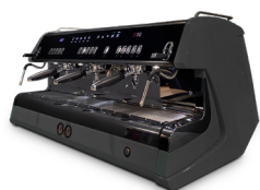
Black / Nero