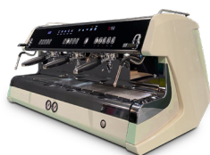
Beige / Beige