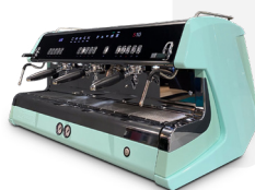
Water Green / Verde Acqua